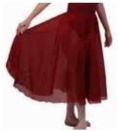
Chiffon Skirt in burgundy (made for KDA specifically)

Please measure your waist and your waist to 3 inches below the knee. These skirts are made to measure so cannot be exchanged, please measure carefully.