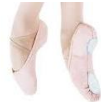
Capezio Cobra Split Sole Canvas Ballet Shoe in pink (elastic sewn in a cross shape)