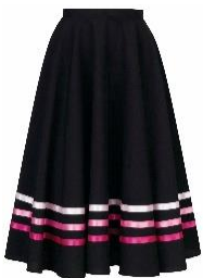
3 Shades of Pink/Burgundy ribbon (specific to KDA, not available from elsewhere)

Please measure your waist and your waist to 3 inches below the knee. These skirts are made to measure so cannot be exchanged, please measure carefully.