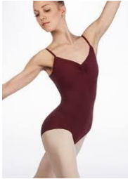
Bloch Royal Leotard in Burgundy

Waistband in Burgundy (made for KDA specifically)